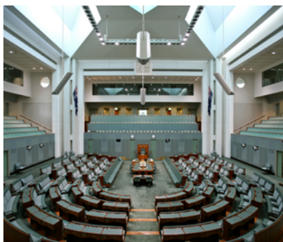
House of Representatives