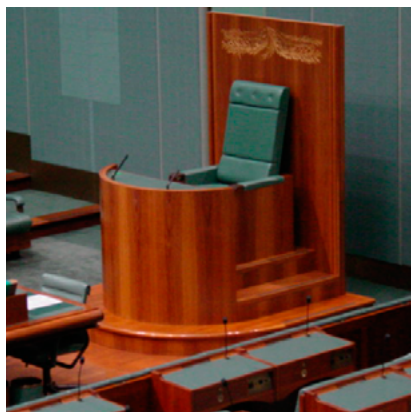
The speaker's chair